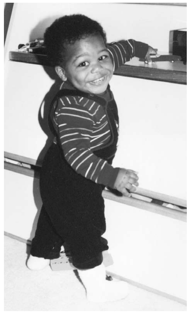
A child is always a blessing

artificial interference with conception is acceptable because, so it is supposed, human beings are mere biological beings. Yet Sacred Scripture teaches us that our bodies, like our souls, are holy to God: "Shun immorality. Every other sin which a man commits is outside the body; but the immoral man sins against his own body. Do you not know that your body is a temple of the Holy Spirit within you, which you